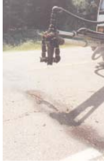
2 Spray injection patching used on a pothole