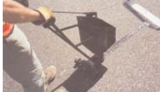
3 Place sealant meeting Mn/DOT spec. 3725.