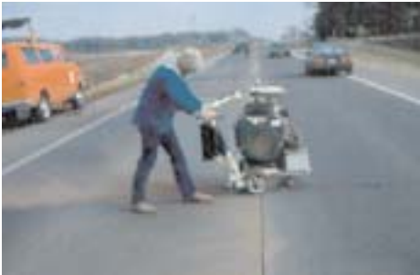
1 Rout cracks.