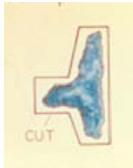
1 Mark area to be patched, extending at least 1 foot outside the distressed area.