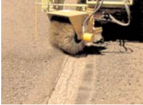
1 Mill and sweep crack to remove any loose material.