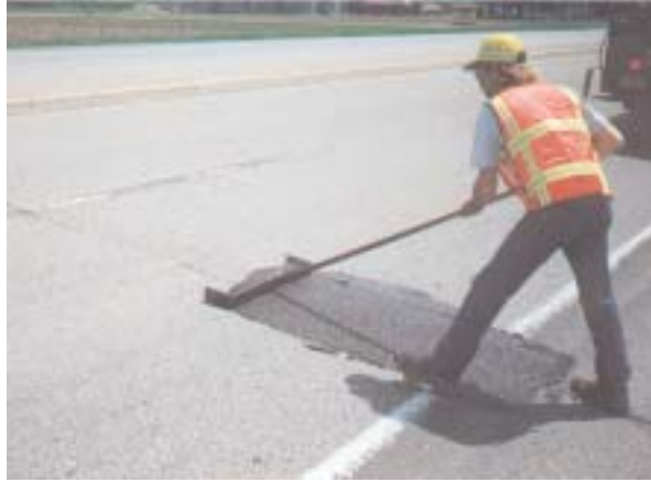
2 Strike off slurry material.