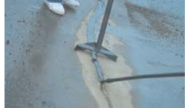
3 Strike off sealant with squeegee to create over-band.