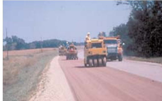
2 Use a minimum of three rubber-tired rollers, all at 5 mph maximum speed.