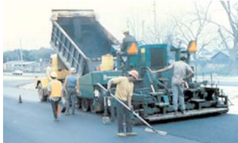
Specification 2350 is the recommended mixture. Place with a paver.