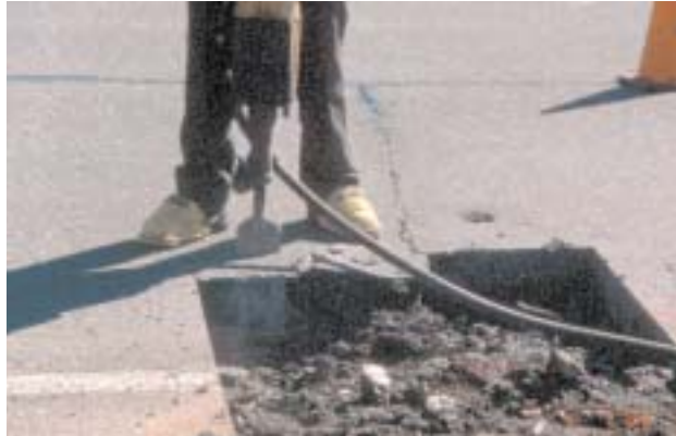
2 Remove as much pavement as needed to reach firm support.