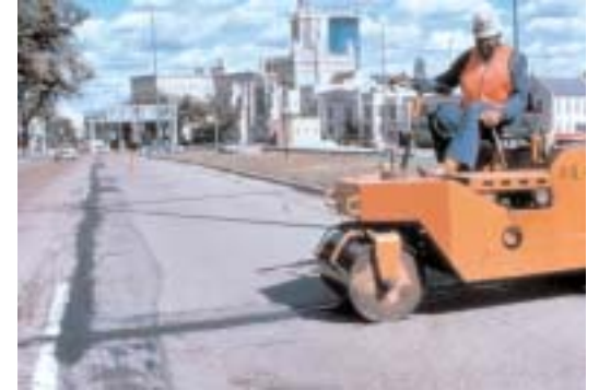
4 Compact the hot mix with roller so that patch is flush with adjacent pavement.