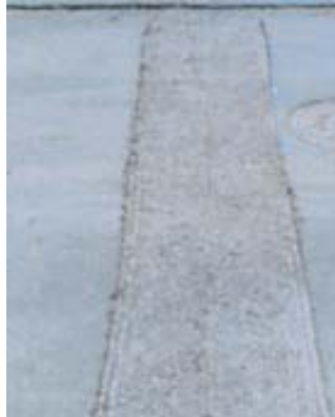
2 A clean reservoir ready for new hot mix