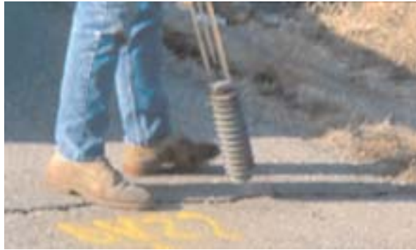
1 Dry thoroughly with hot-air lance or high-pressure air hose.