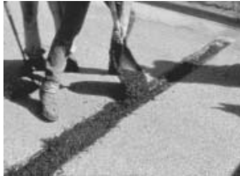
3 Place hot mix neatly in reservoir.