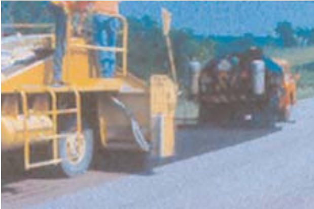
1 Minimize the distance between the binder distributor and aggregate spreader.