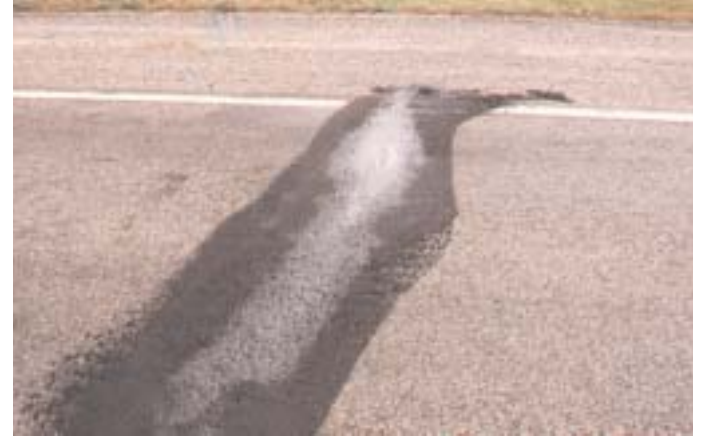
3 Completed repair