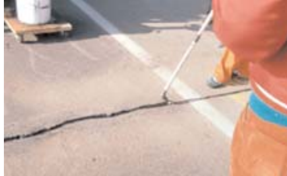
2 Fill clean crack with sealant.