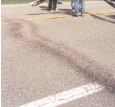
1 Spray injection crack repair

Spray injection patching , also referred to as blow patching, uses air pressure to apply asphalt emulsion and aggregate into large cracks and potholes.