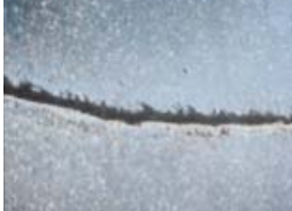
2 Remove debris before placing sealant.