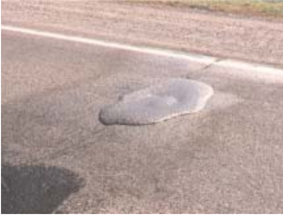
1 Deposit sufficient slurry to fill crack.