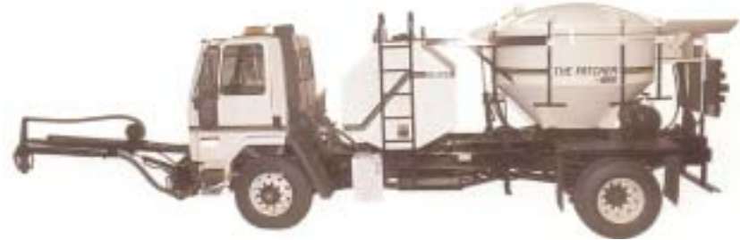
3 Spray injector