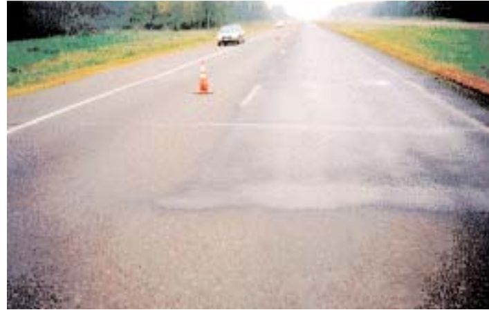
Fog seal just applied, prior to cure