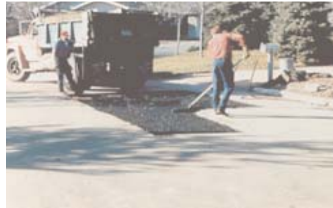
3 Place patching material in hole and compact.