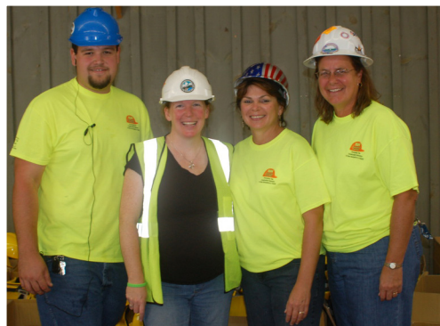
Fearless leaders, 2015 NH CCD