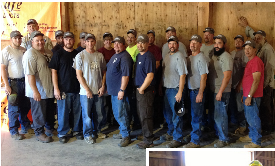
Winning teams, 2015 Ken Ward Plow Rally