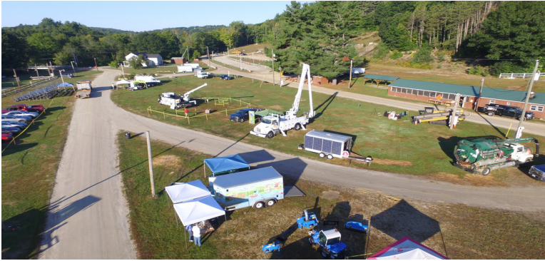
Drone view of New Boston Fairgrounds, September 2015, Ken Ward Plow Rally