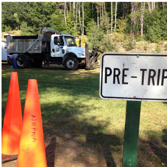
Pre Trip station, 2015 Plow Rally