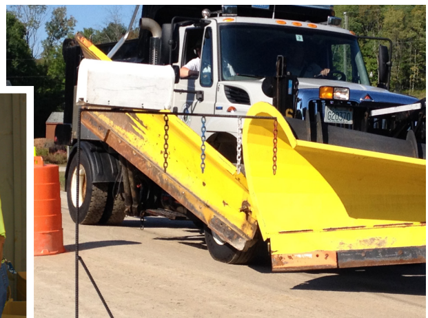
Wing Slalom, 2015 Plow Rally