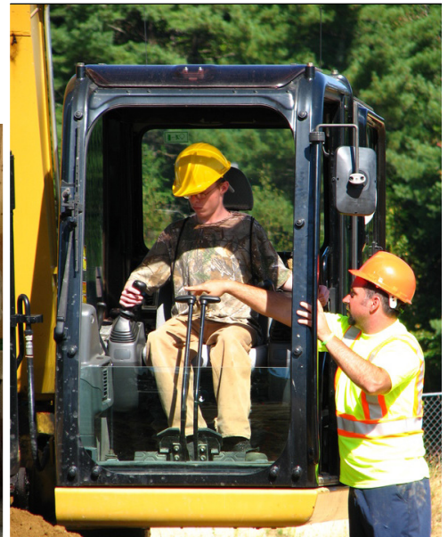
Personal instruction, 2015 CCD