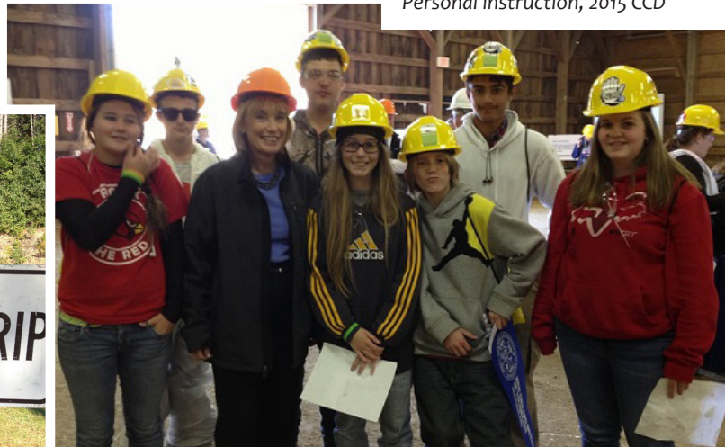
Gov. Hassan visits 2015 CCD