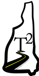
New Hampshire Technology Transfer Center