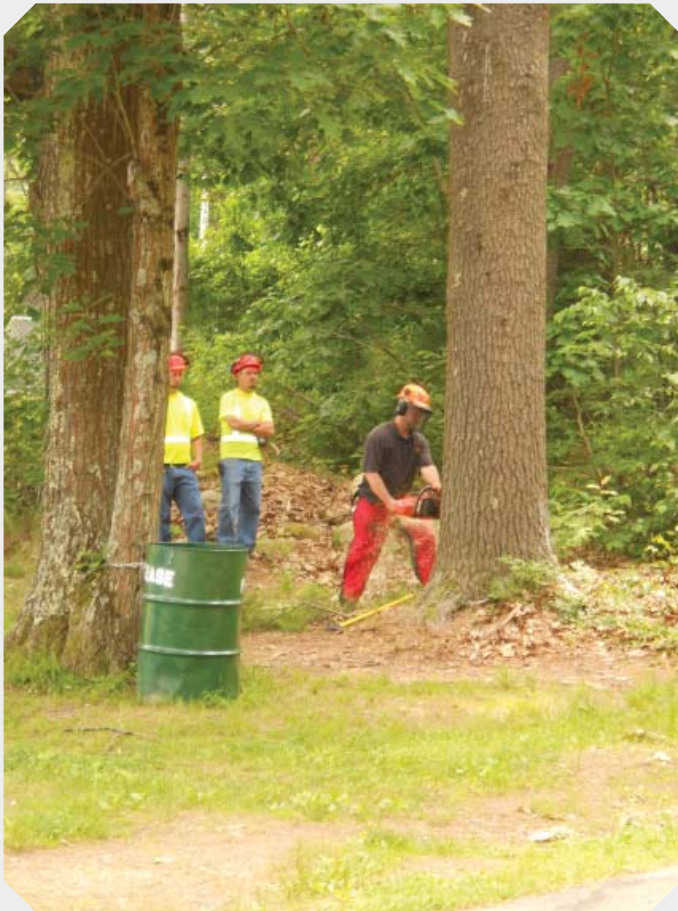
Attendees of the September 2012 Chainsaw Safety Course

Always read and follow your chainsaw owner’s manual!