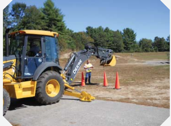
Participants at the 2013 Ken Ward Memorial Plow Rally