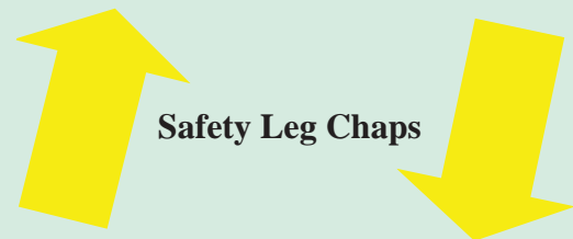
Safety Leg Chaps